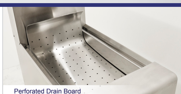
Oil Drip Pan